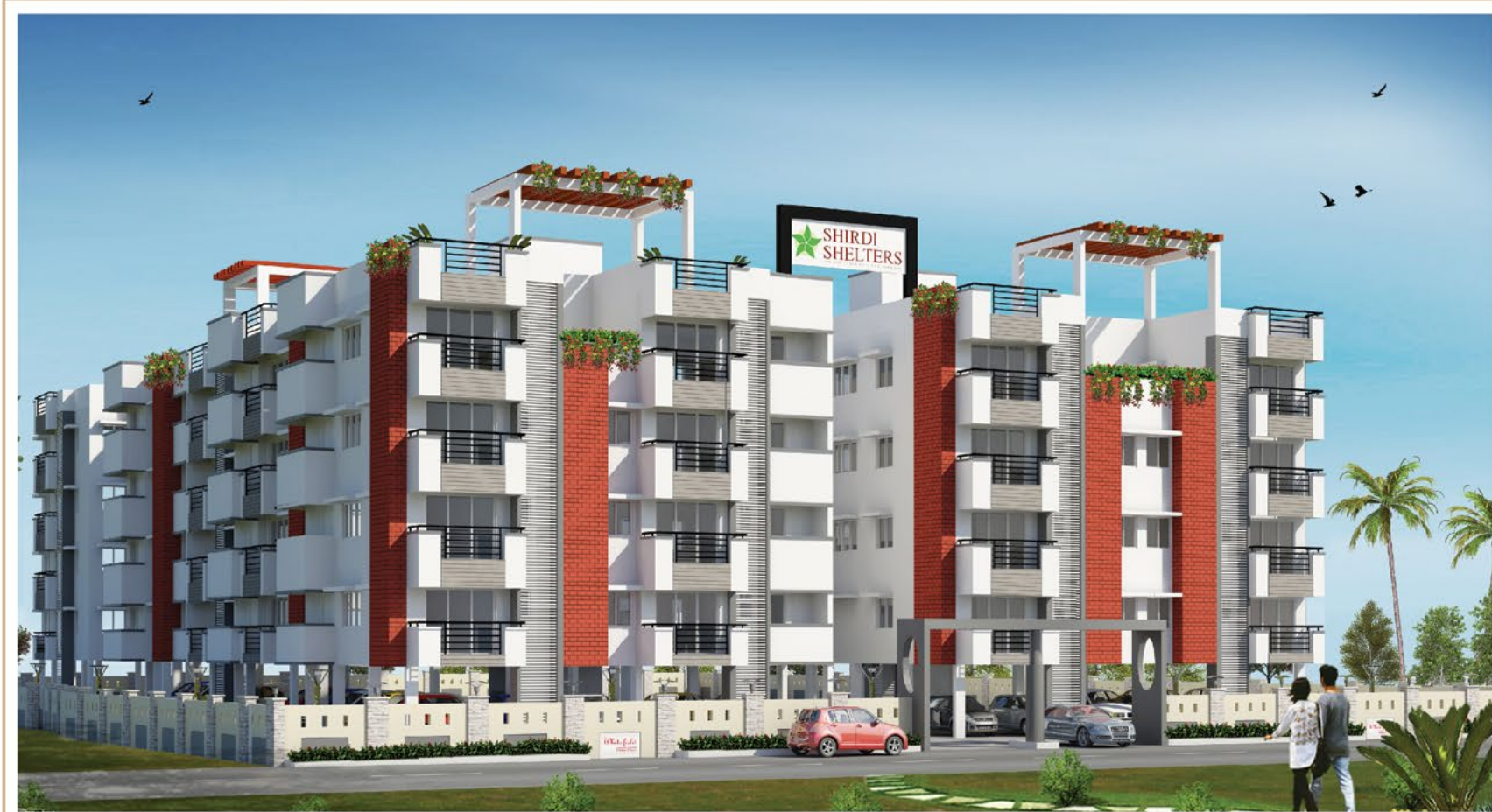
WHITEFIELD MUDRA PHASE 1