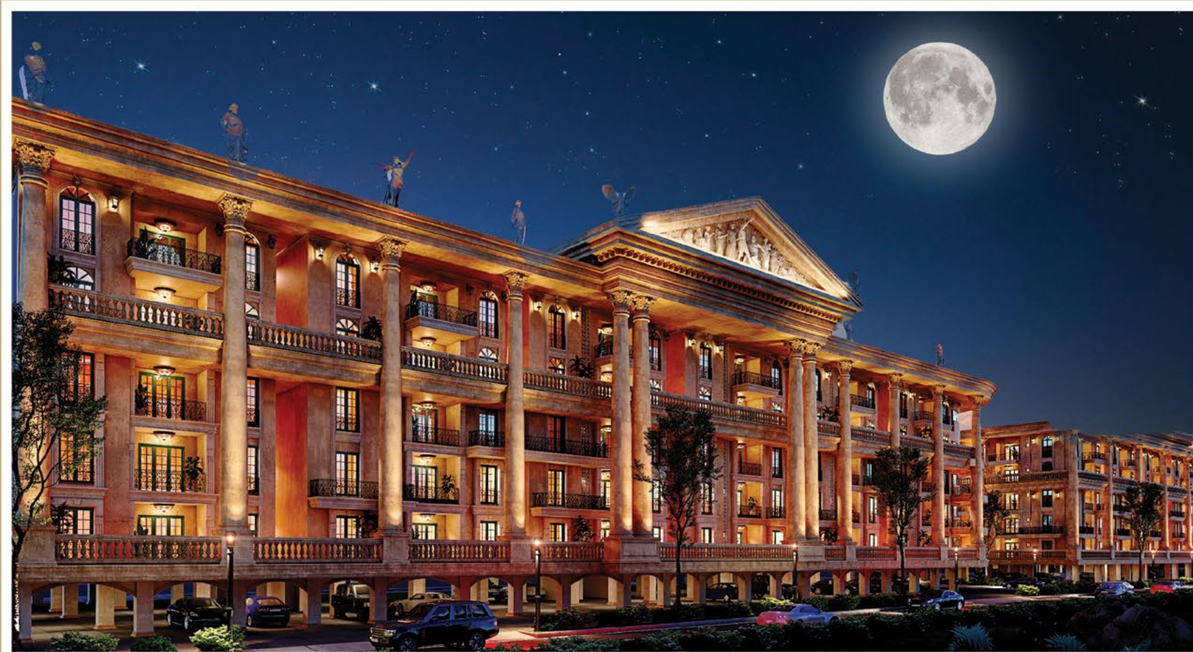
WHITEFIELD MUDRA PHASE A