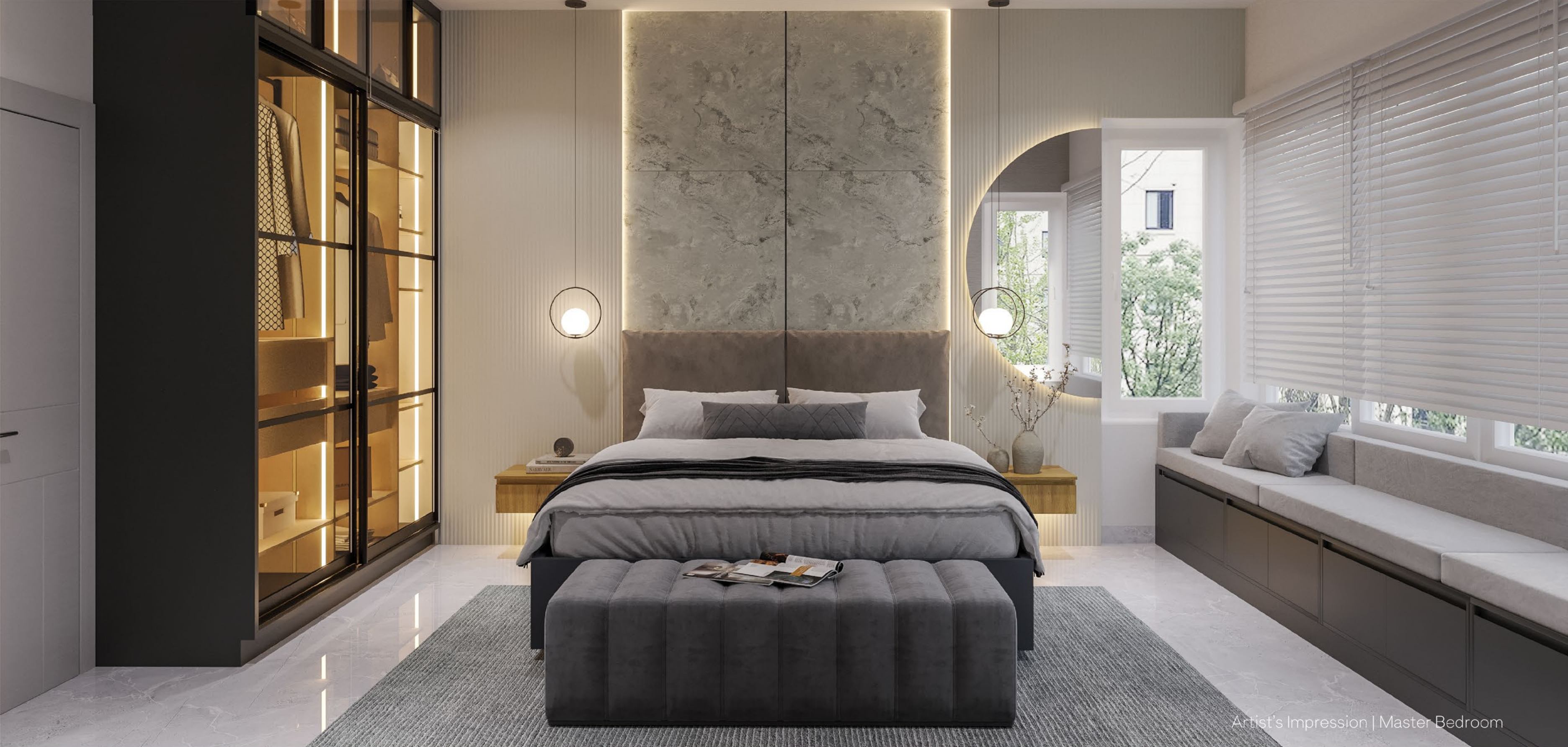
Artist's Impression | Master Bedroom