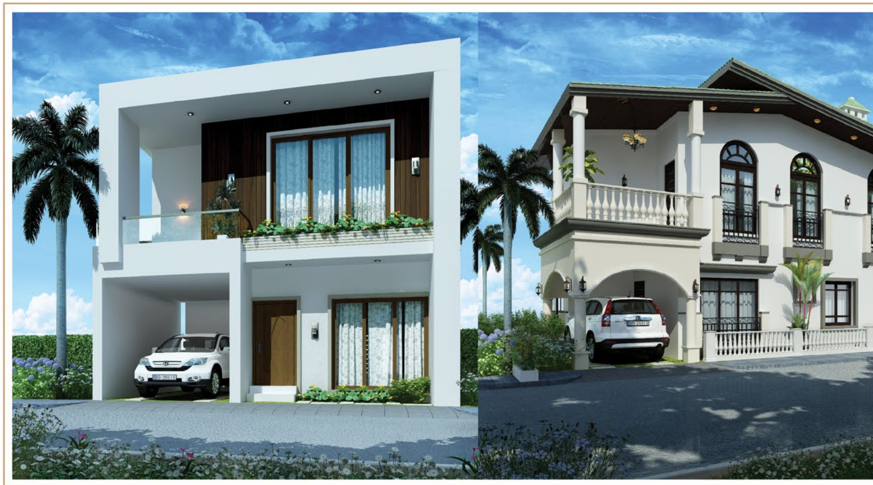
VILLA - MEDAVAKKAM