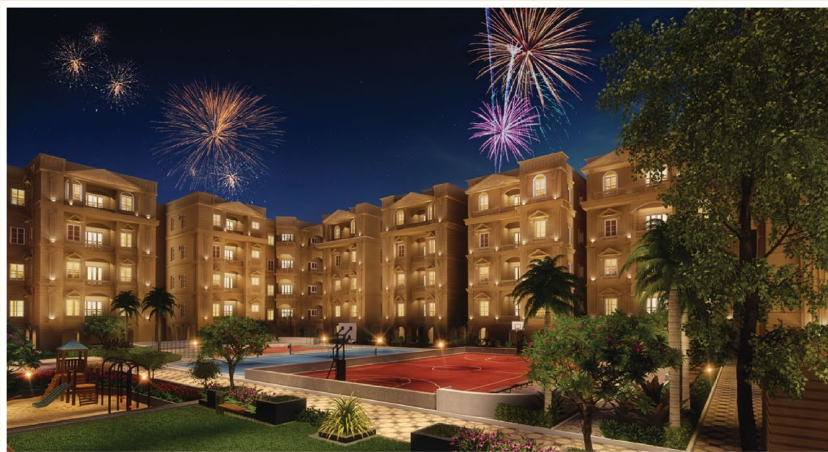
WHITEFIELD MUDRA PHASE 3