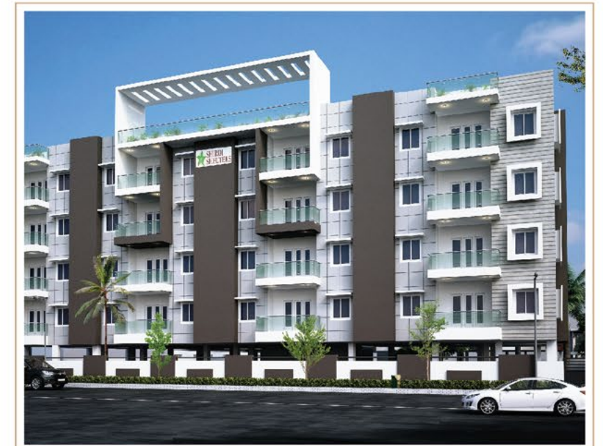
WHITEFIELD MUDRA PHASE 2