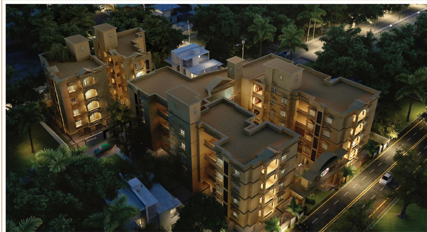
SEMBAKKAM - WHITEFIELD GRAND - C