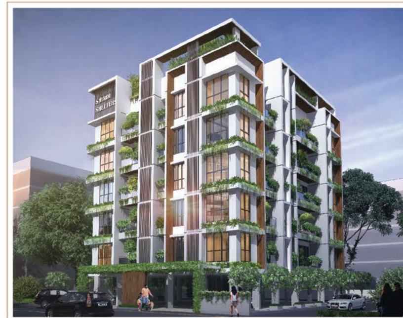
CHITLAPAKKAM - KHANIKA