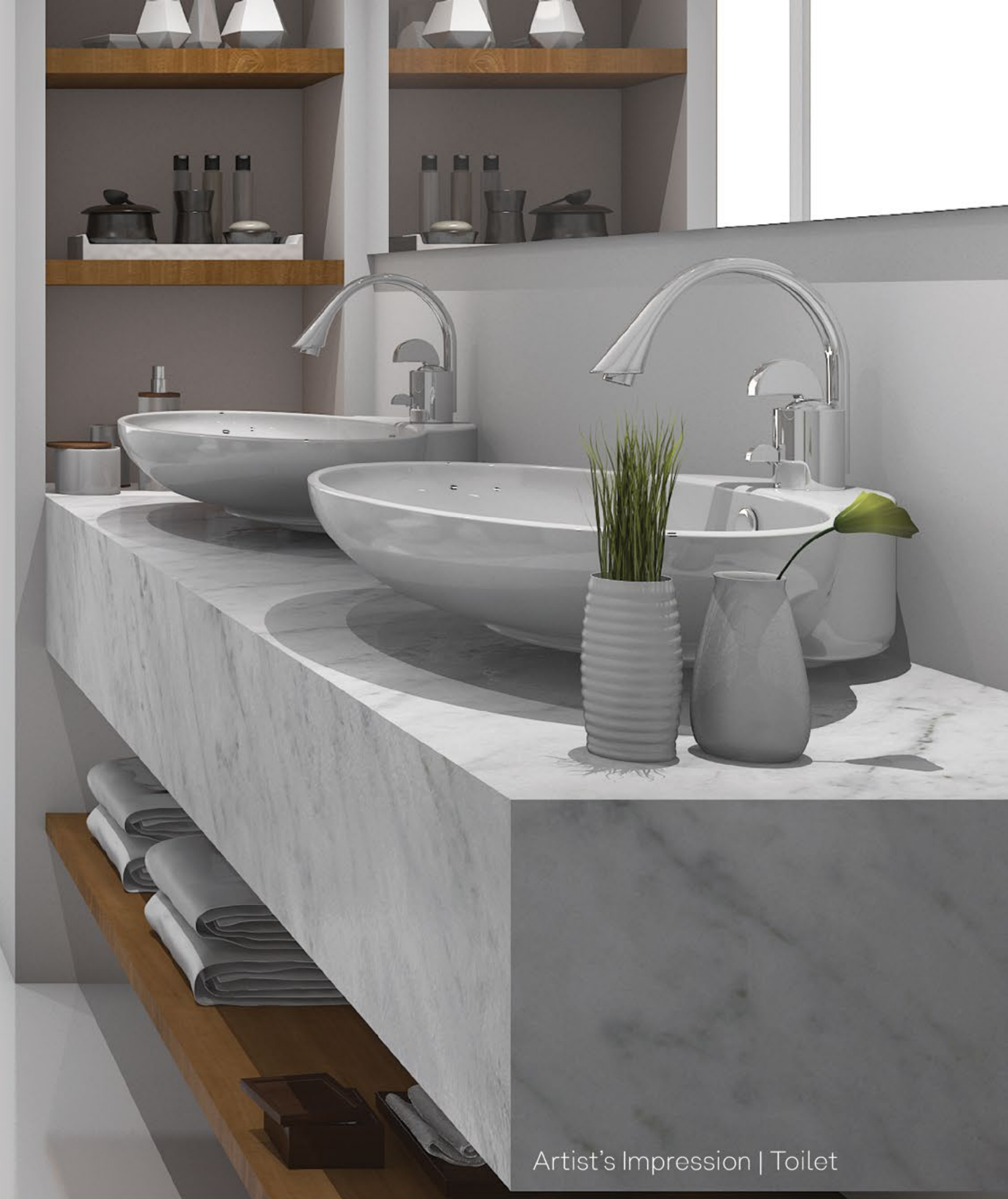
Artist's Impression | Toilet